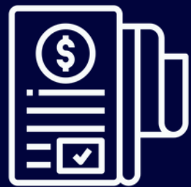
Vendor Invoicing ( IB )