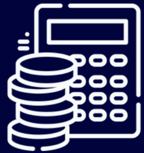
Accounting and MIS