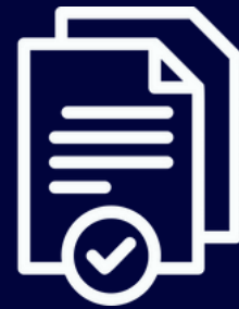
Client Invoicing ( OB )